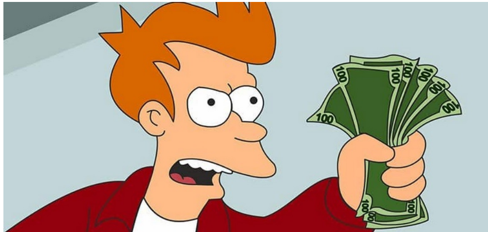
Shut Up And Take My Money! still from the science fiction animated sitcom Futurama from 20th Television, episode Attack of the Killer App (2010).